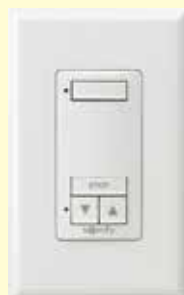
Wireless Wall Switch