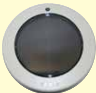
Wireless Sun Sensor

KE Durasol incorporates state-of-the-art UL listed and CE approved motors and electronics from Somfy, the industry leader, as well as American Heritage™. KE Durasol offers a 5 year warranty on all motors and electronics. Your KE Durasol dealer will work with you to design a shading solution that allows for a one touch wireless control to fully automated functionality.