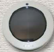
Wireless Sun Sensor

5 year warranty on all motors and electronics